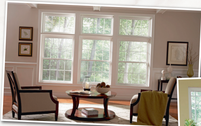
◀ SINGLE & DOUBLE HUNG